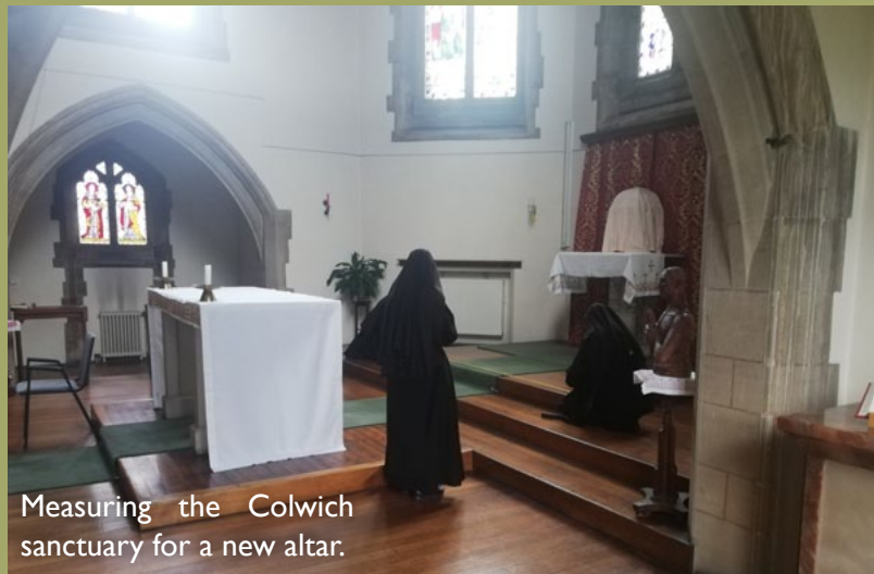
Measuring the Colwich sanctuary for a new altar.