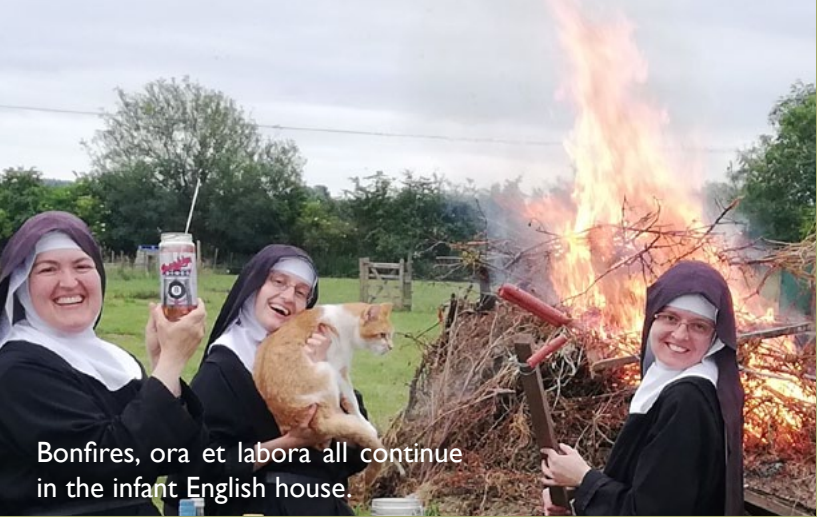
Bonfires, ora et labora all continue in the infant English house.