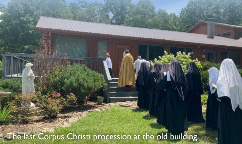
The last Corpus Christi procession at the old building. Below: Sisters keep busy while enjoying recreation.