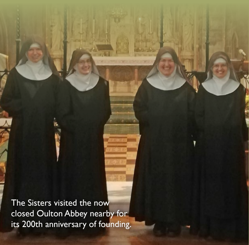
The Sisters visited the now closed Oulton Abbey nearby for its 200th anniversary of founding.