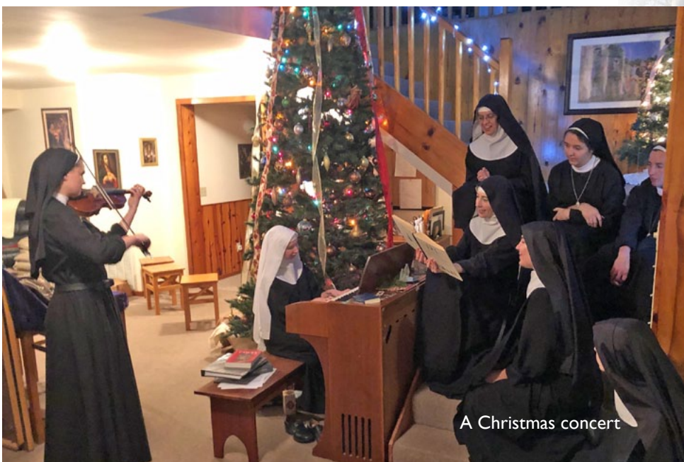
A Christmas concert