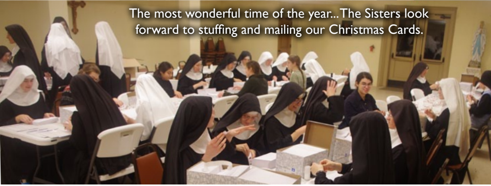
The most wonderful time of the year...The Sisters look forward to stuffing and mailing our Christmas Cards.