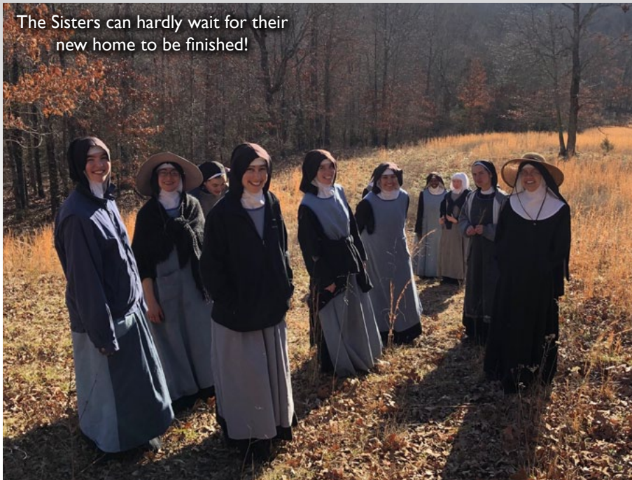
The Sisters can hardly wait for their new home to be finished!