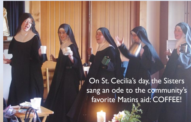
On St. Cecilia's day, the Sisters sang an ode to the community's favorite Matins aid: COFFEE!

We are also still full-steam ahead on our construction project in Ava, though the fundraising efforts have still been quite slow. But we know the Lord will see us through with the help of Saint Joseph! Thank you also for all your help in that area as well. May God reward you for everything!