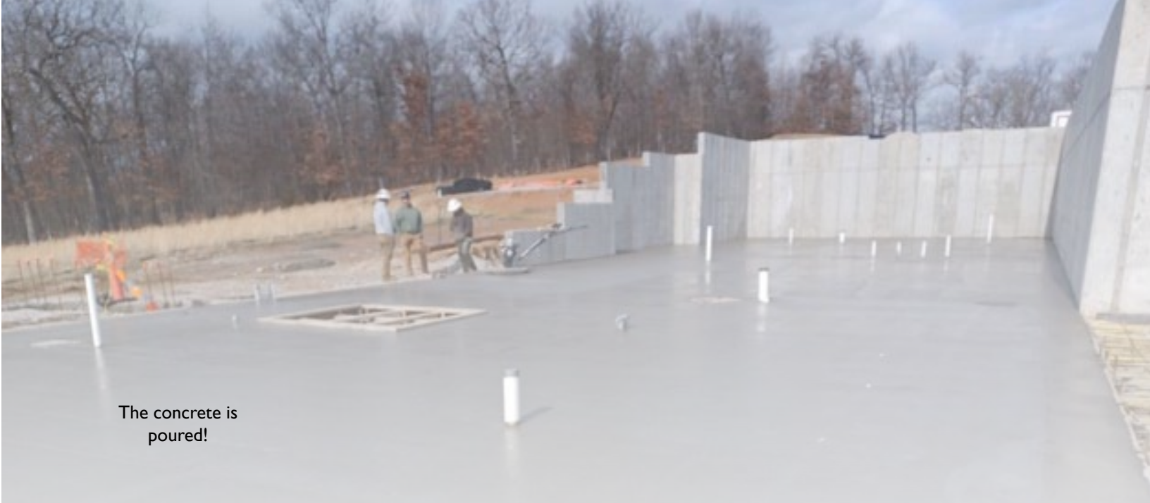
The concrete is poured!