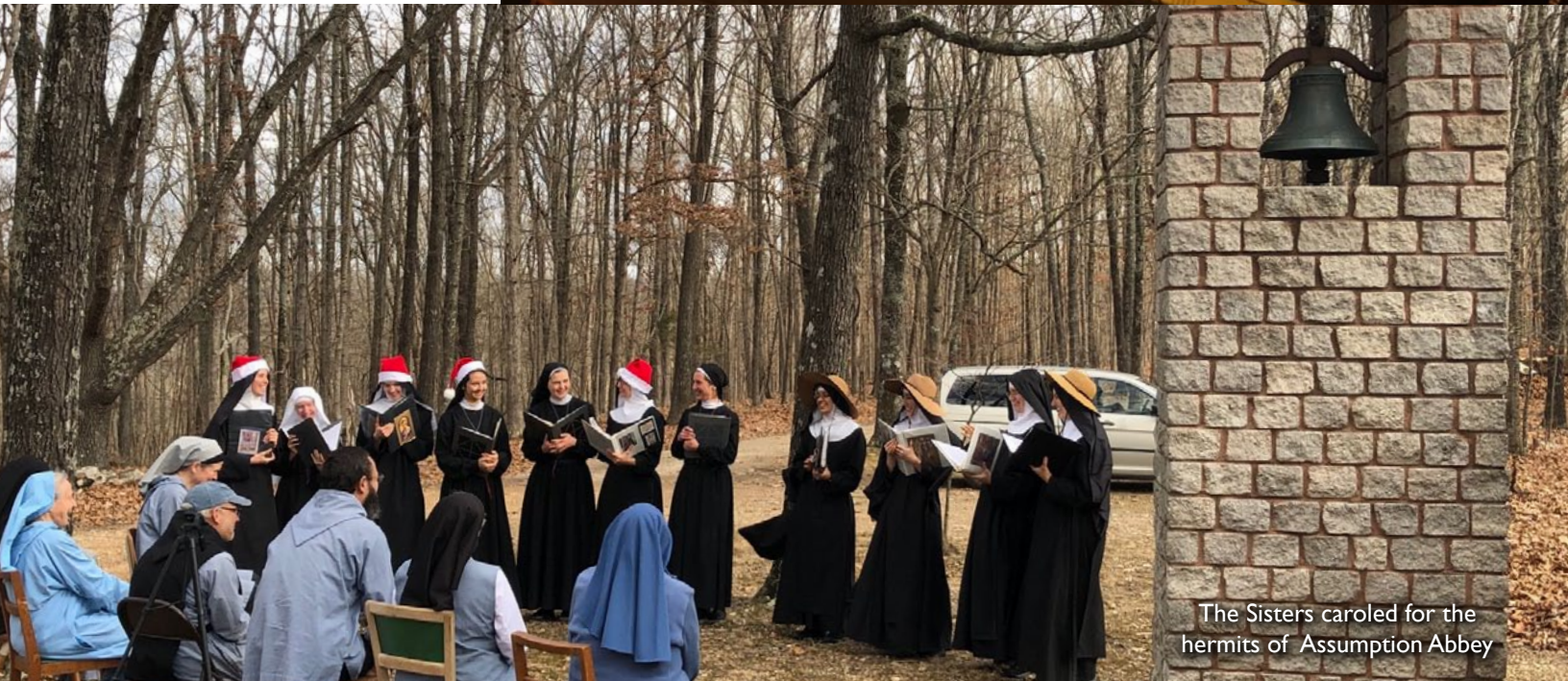
The Sisters caroled for the hermits of Assumption Abbey