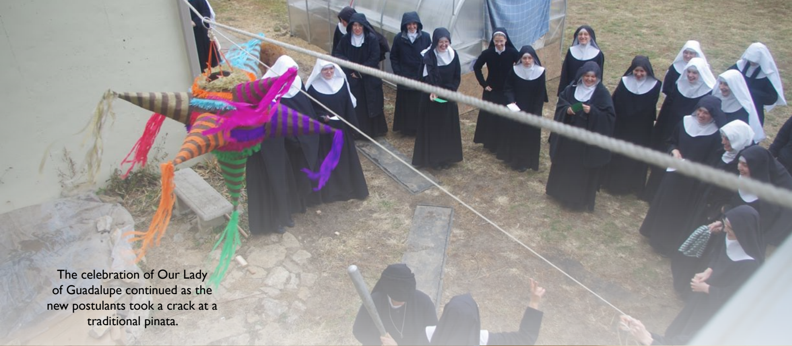
The celebration of Our Lady of Guadalupe continued as the new postulants took a crack at a traditional pinata.