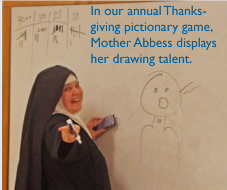
In our annual Thanksgiving pictiory game, Mother Abbess displays her drawing talent.