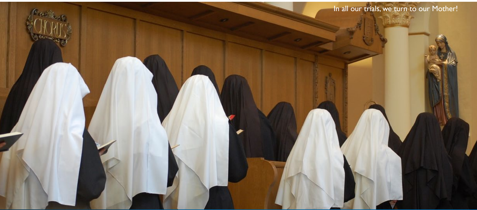
In all our trials, we turn to our Mother!