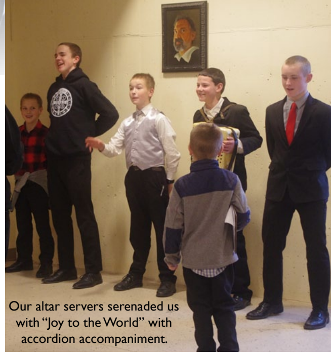
Our altar servers serenaded us with "Joy to the World" with accordion accompaniment.