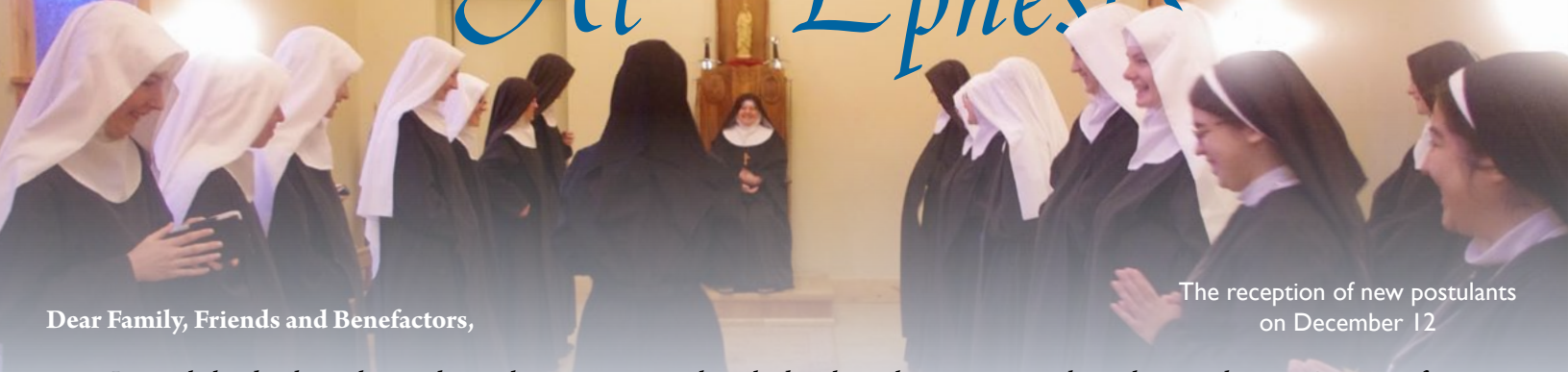
The reception of new postulants on December 12