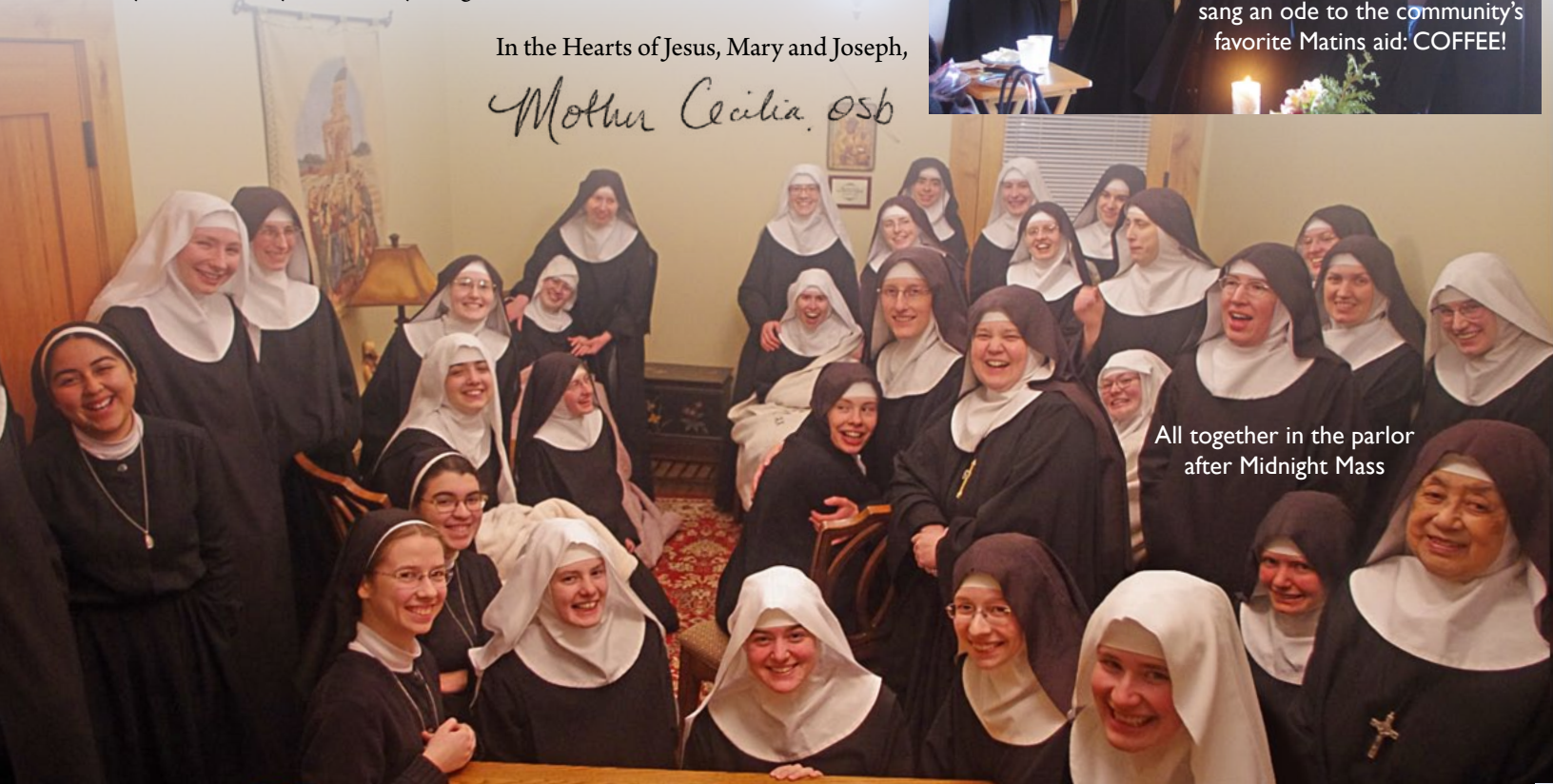
All together in the parlor after Midnight Mass