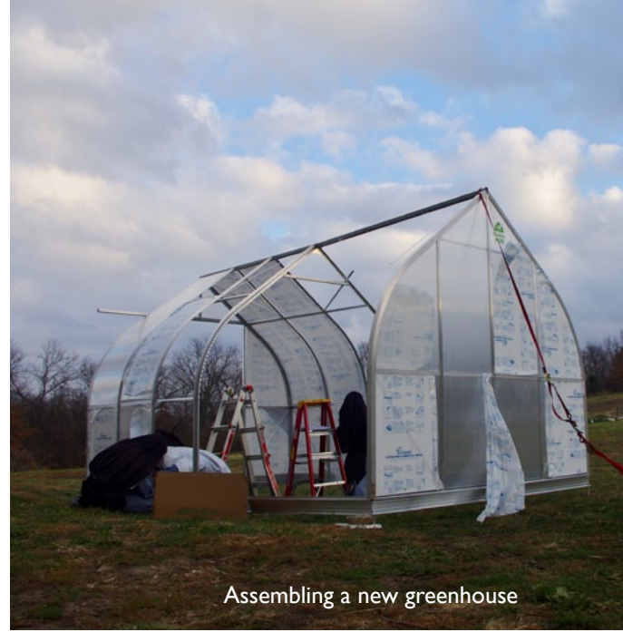
Assembling a new greenhouse