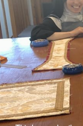
This humeral veil was pinned in no time!

More and more faithful gather weekly for Mass near the Ava monasery.