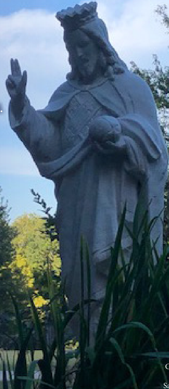
Christ the King statue at the Monastery of Saint Joseph, Ava, MO

Jesu, tibi sit gloria, Qui sceptrum mundi temperas, Cum Patre, et almo Spiritu, In sempiterna sæcula. Amen.