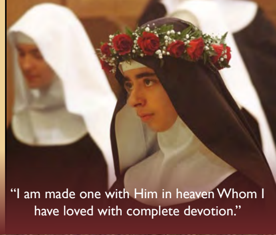
"I am made one with Him in heaven Whom I have loved with complete devotion."