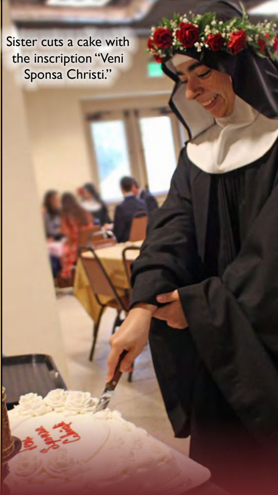
Sister cuts a cake with the inscription "Veni Sponsa Christi."