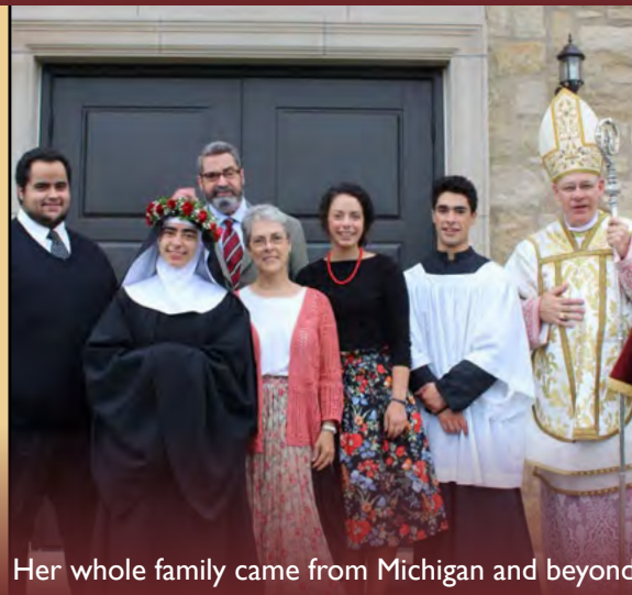
Her whole family came from Michigan and beyond.