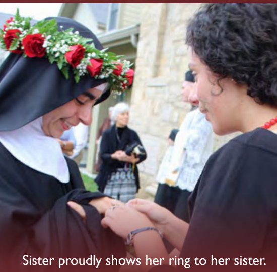
Sister proudly shows her ring to her sister.