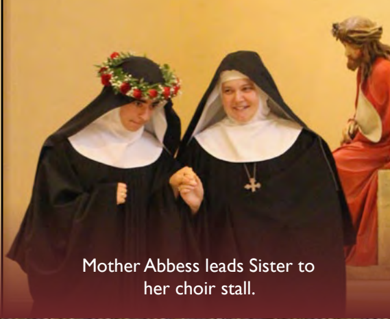
Mother Abbess leads Sister to her choir stall.