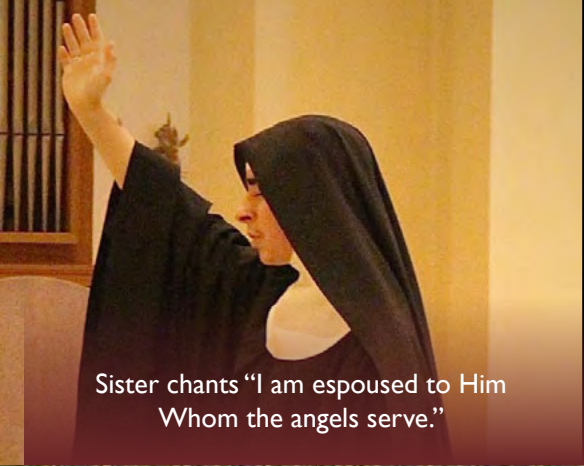
Sister chants "I am espoused to Him Whom the angels serve."