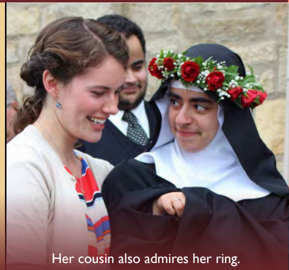
Her cousin also admires her ring.