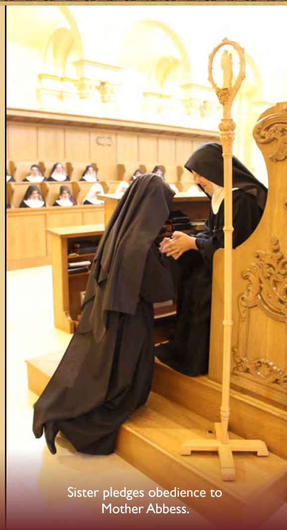
Sister pledges obedience to Mother Abbess.