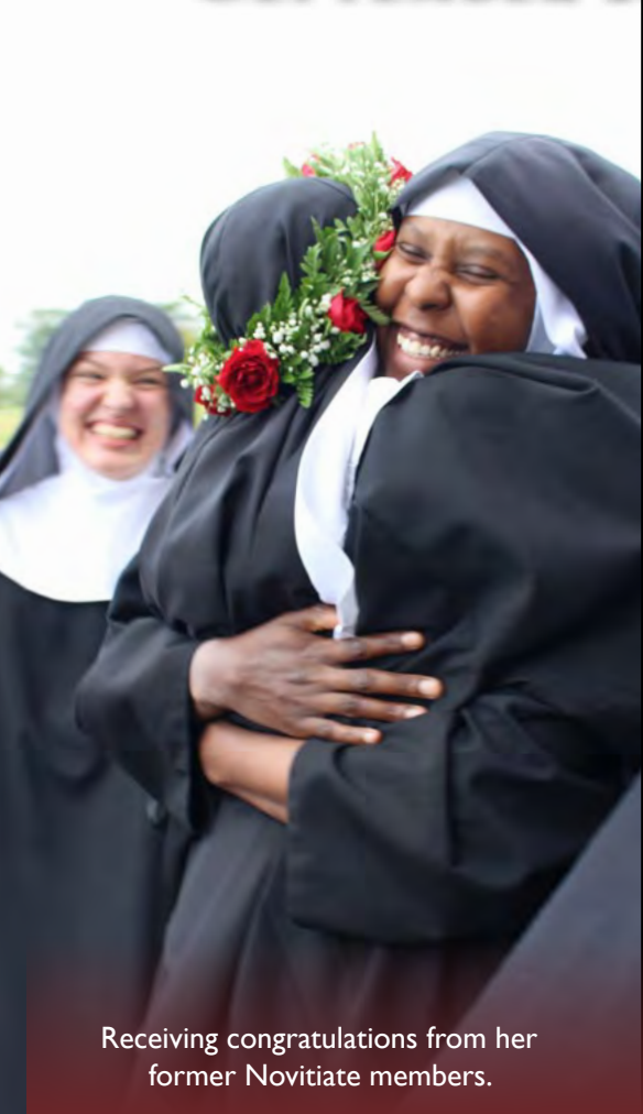
Receiving congratulations from her former Novitiate members.