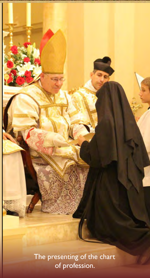
The presenting of the chart of profession.