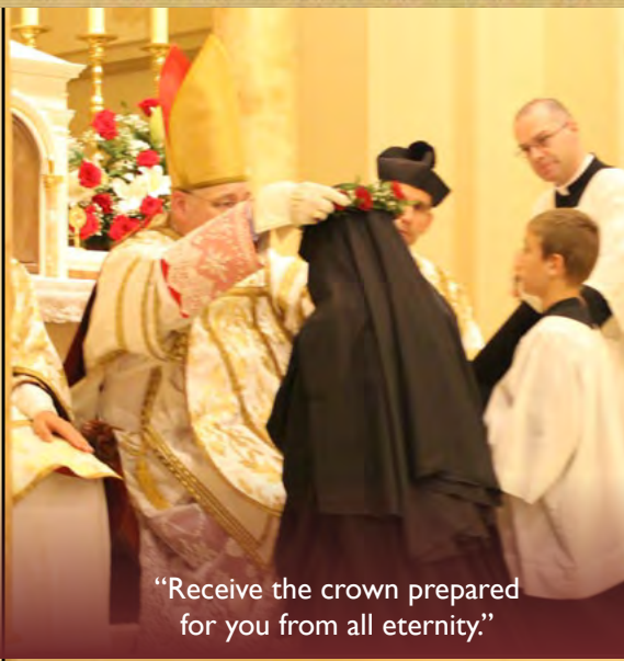
"Receive the crown prepared for you from all eternity."