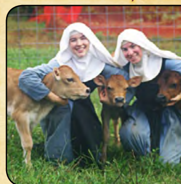
Three new arrivals (above) came around the same time as our first three candidates. Below: the crowning of a new statue of the Immaculate Heart from Fatima.