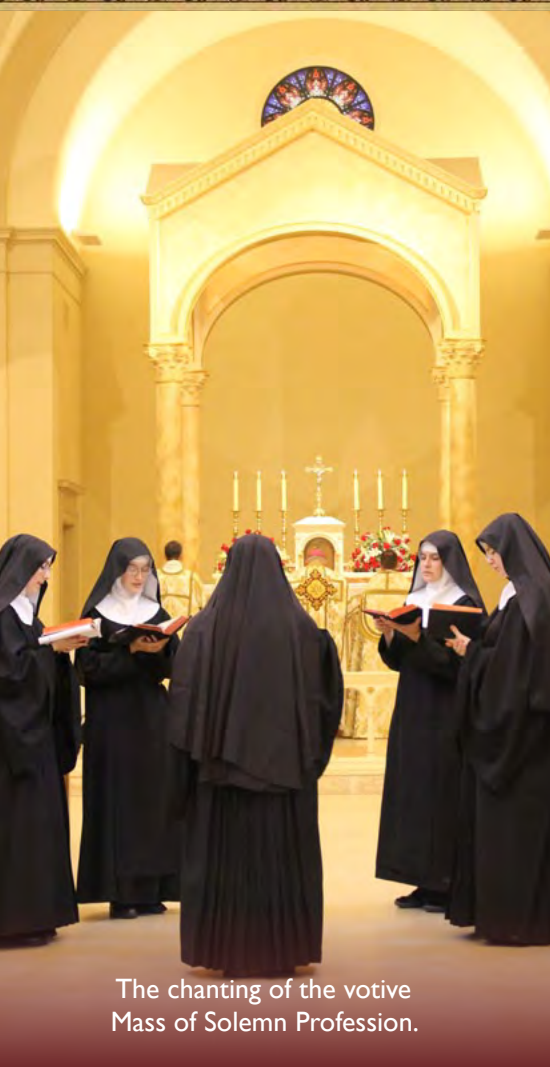
The chanting of the votive Mass of Solemn Profession.