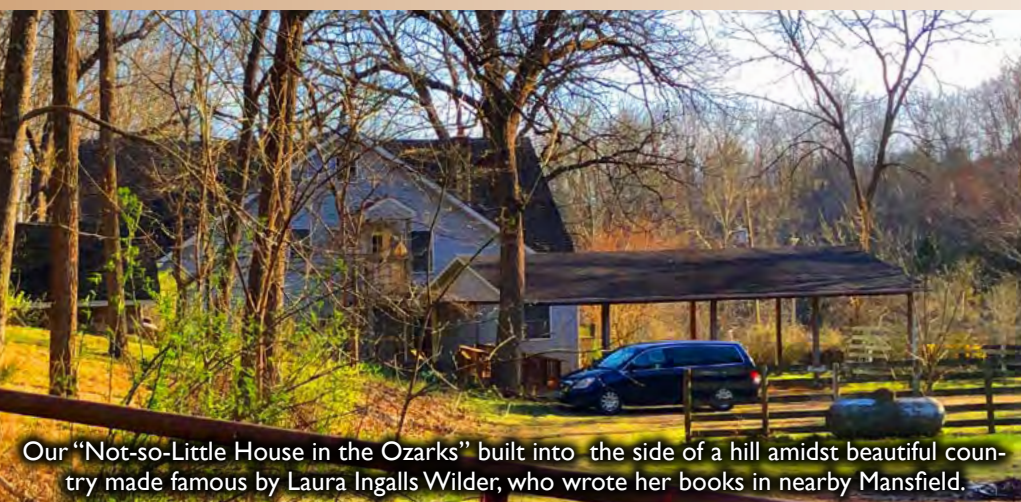
Our "Not-so-Little House in the Ozarks" built into the side of a hill amidst beautiful country made famous by Laura Ingalls Wilder, who wrote her books in nearby Mansfield.