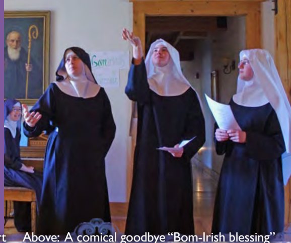
Above: A cautionary song warned future Ava postulants what not to do. Below: A Haydn concert Above: A comical goodbye "Bom-Irish blessing"