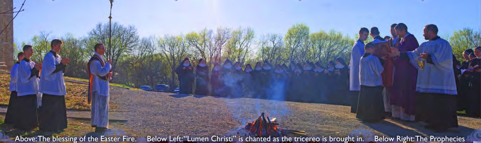
Above: The blessing of the Easter Fire.