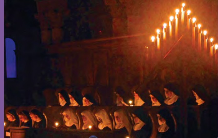
Above: Tenebræ Below: Compline following the evening liturgies