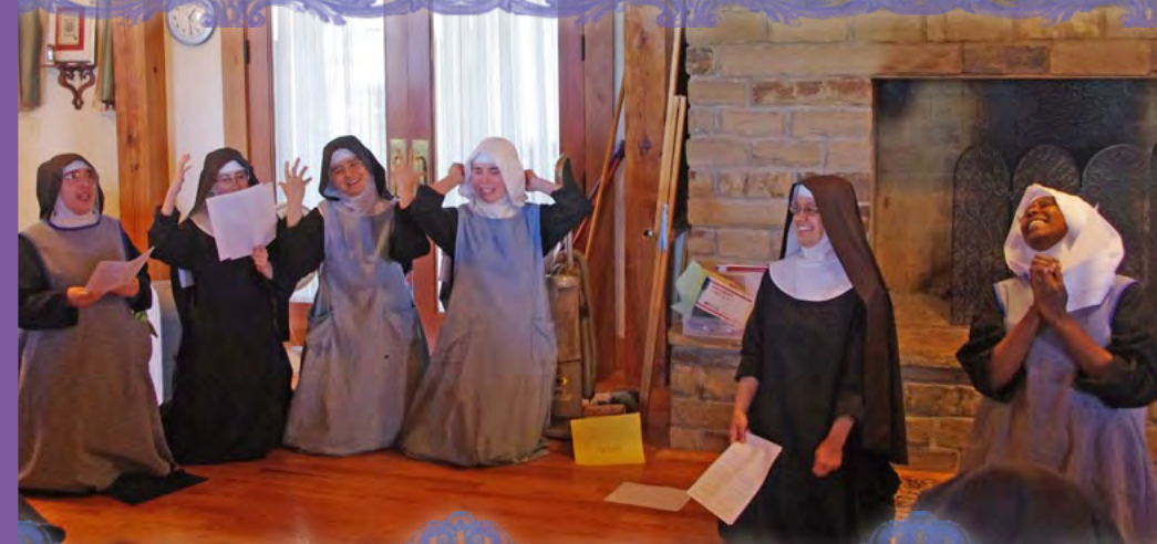
Above: The foundresses did their own skit about approaching trials. Above right: The Sisters receive Mother Abbess' blessing before the send-off.