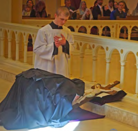
The veneration of the Cross at the Solemn Afternoon Liturgy of Good Friday.