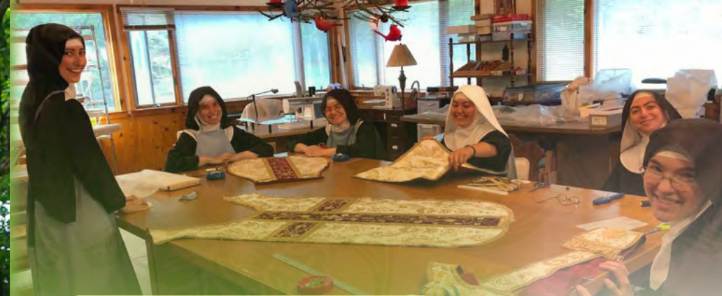
Our Ava Sisters help shorten the waiting list for House of Ephesus vestments.