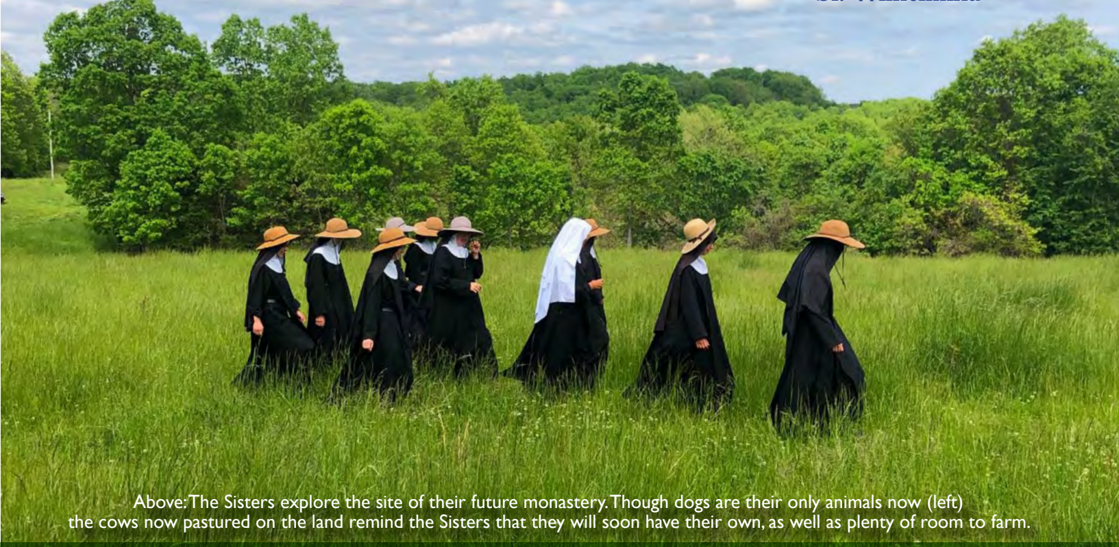
Above: The Sisters explore the site of their future monastery. Though dogs are their only animals now (left) the cows now pastured on the land remind the Sisters that they will soon have their own, as well as plenty of room to farm.