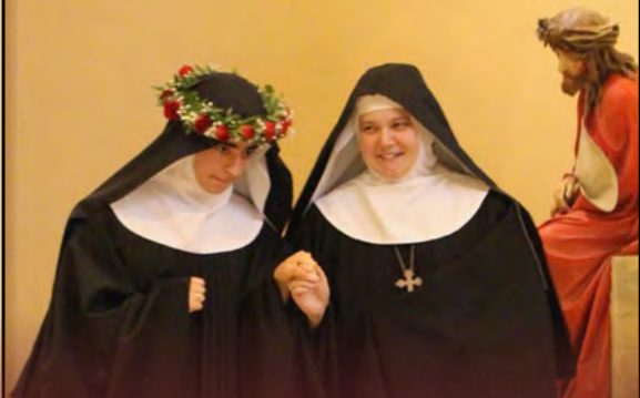
Mother Abbess leads Sister to her choir stall.

EPTEMBER 28TH, 2019 MICHAELMAS EVEN MARKEN