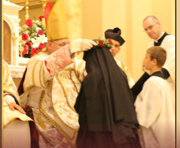
"Receive the crown prepared for you from all eternity."