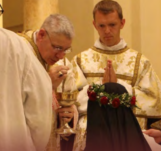
"May the Body of Christ keep your soul unto everlasting life."