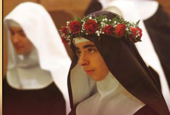
"I am made one with Him in heaven Whom I have loved with complete devotion."

EPTEMBER 28TH, 2019 MICHAELMAS EVEN MARKEN