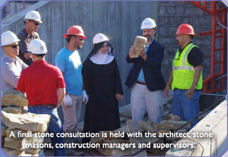
A final stone consultation is held with the architect, stone masons, construction managers and supervisors.

Glorious St. Joseph, foster-father and protector of Jesus Christ! To you do we raise our hearts and hands to implore your powerful intercession. Please obtain for us from the kind Heart of Jesus the help and graces necessary for our spiritual and temporal welfare. We ask particularly for the grace of a happy death, and the special favor we now implore, the means to pay the construction costs each month on our church, without the necessity of a loan. Guardian of the Word Incarnate, we feel animated with confidence that your prayers on our behalf will be graciously heard before the throne of God. V. O glorious Saint Joseph, through the love you bear to Jesus Christ, and for the glory of His name, R. Hear our prayers and obtain our petitions. (Our monthly novena to Saint Joseph ending each First Wednesday)