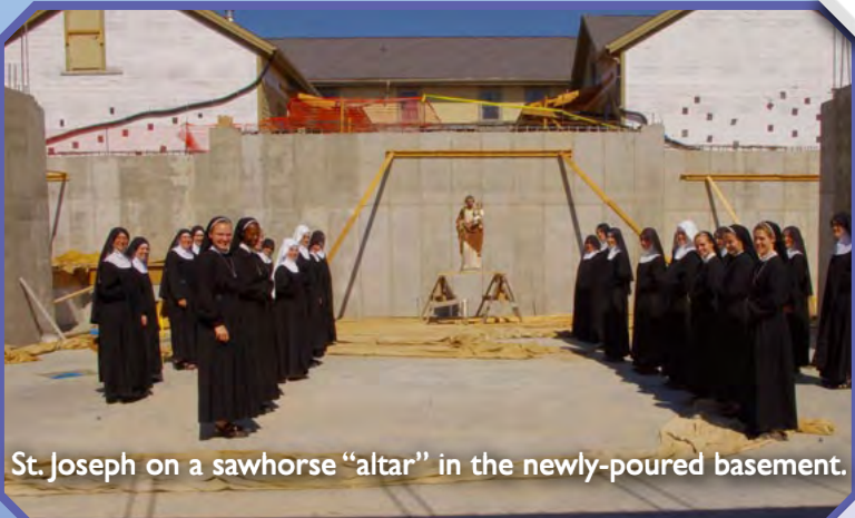
St. Joseph on a sawhorse "altar" in the newly-poured basement.