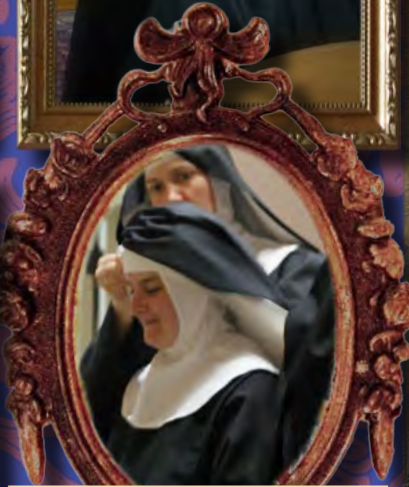
At the end of profession, the white veil is replaced by a black one.