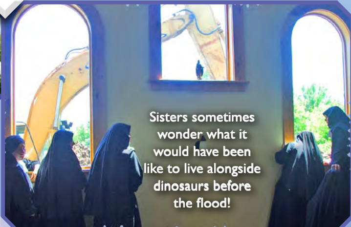
Sisters sometimes wonder what it would have been like to live alongside dinosaurs before the flood!