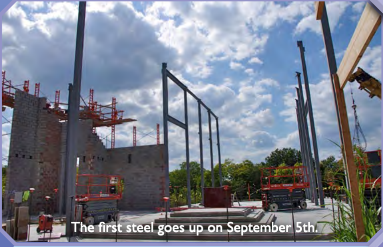
The first steel goes up on September 5th.