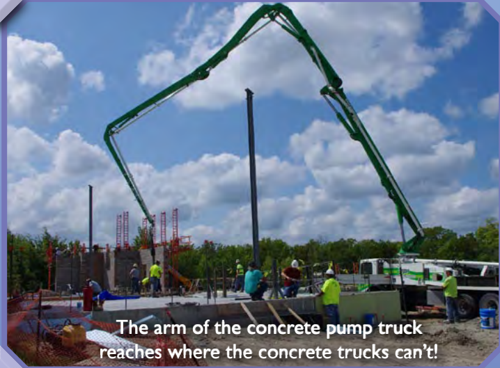
The arm of the concrete pump truck reaches where the concrete trucks can't!