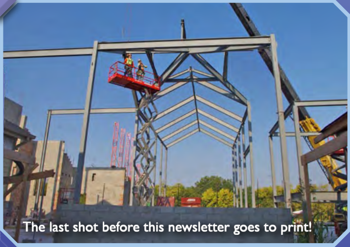
The last shot before this newsletter goes to print!