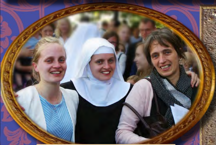
Family members from Europe and all across America were able to join us!