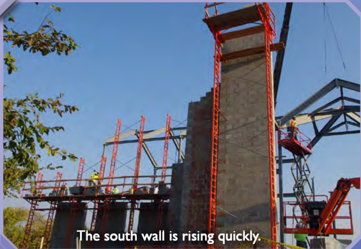
The south wall is rising quickly.

For those who may wish to donate stocks, or from IRA accounts, or to remember us in your will, our federal tax ID number is: 20-4450092.