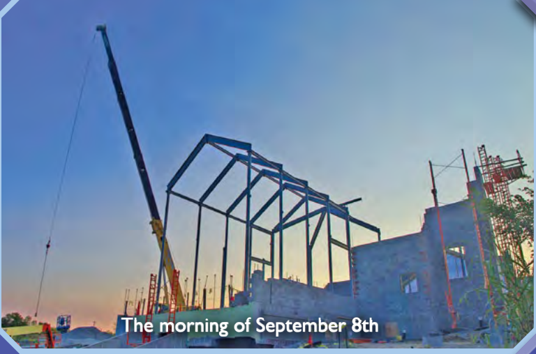
The morning of September 8th