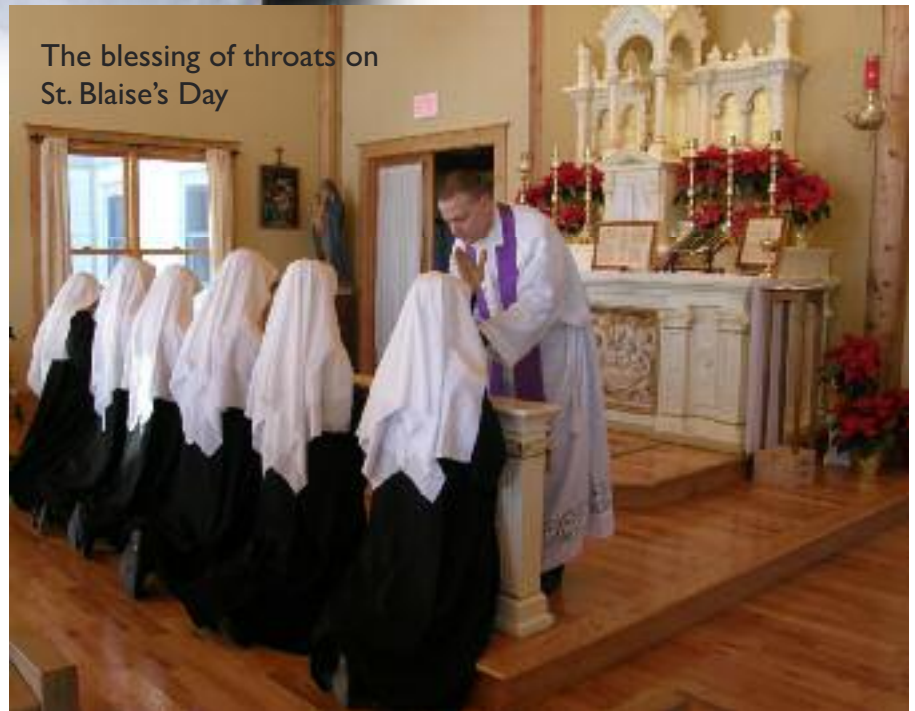
The blessing of throats on St. Blaise's Day