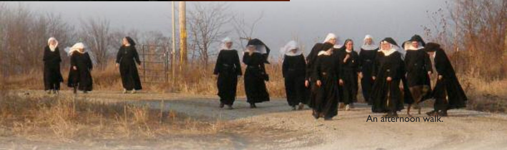
An afternoon walk.