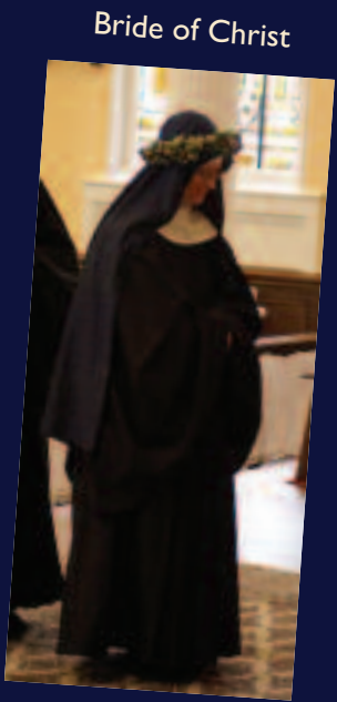
Bride of Christ