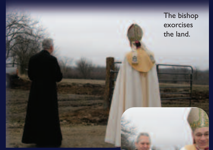
The bishop exorcises the land.

Our building project and gardens, blessed by spring rains, progresses steadily. The foundation is laid and framing is next! With God's grace and your support we're building something to support the Church. This building will first serve as housing for the 23 of us—with room to grow—with an oratory, sewing room, and, in keeping