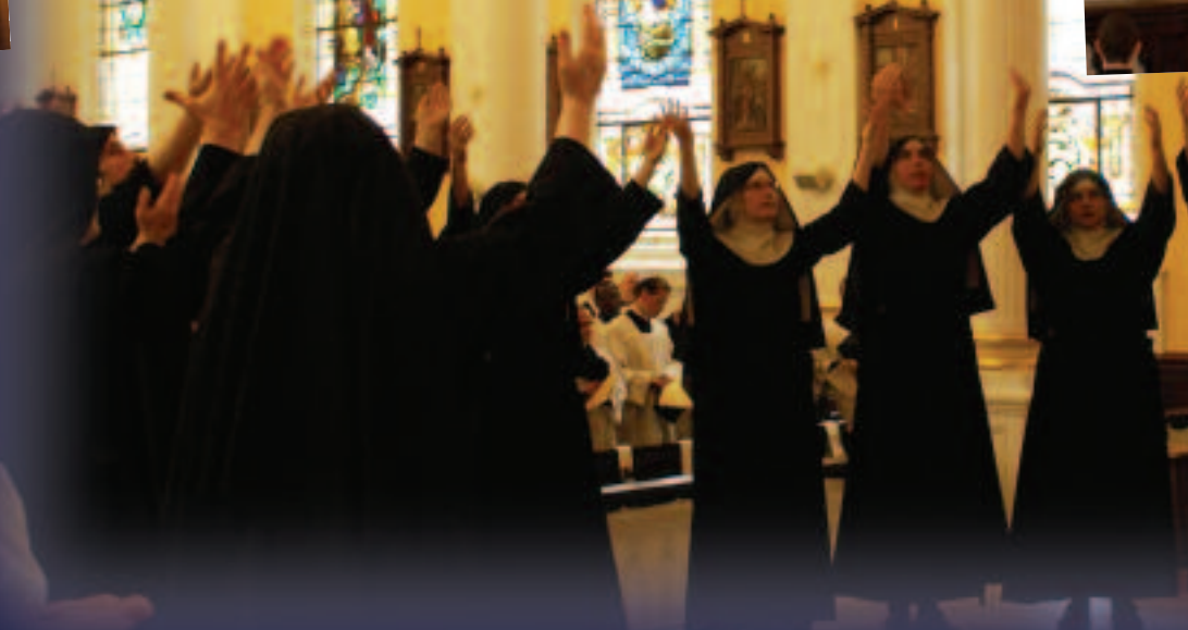
The traditional "Suscipe" as described in the Rule of St. Benedict. The attending monks answered the newly professed by chanting the same.