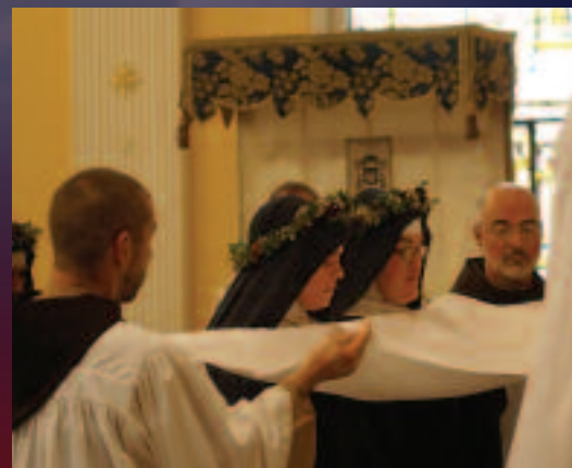
The newly professed received Holy Communion on the top step of the altar; just after the bishop consumed the Body and Blood of Christ.