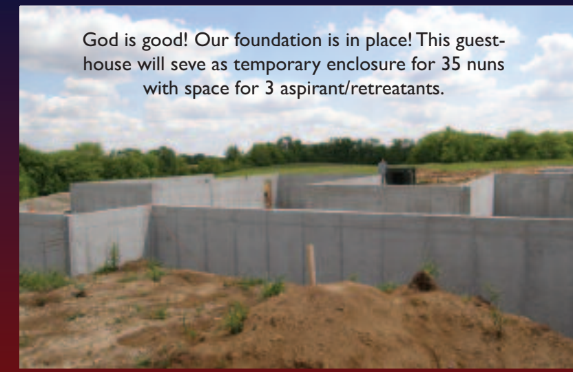
God is good! Our foundation is in place! This guest-house will serve as temporary enclosure for 35 nuns with space for 3 aspirant/retreatants.