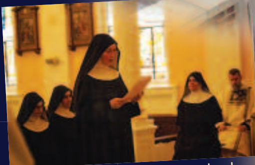
Reading the perpetual vows aloud.