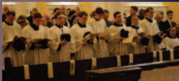
Some of the visiting clergy

This simple and profound act is the purpose and focus of our celebration today. It will be rightly marked with beautiful hymns and words: nothing less than the revealed Word of God and the ancient prayer of the Church. You will hear the names of Sts. Benedict, Scholastica, and the other special patrons. The Signs of Profession will inspire us, and impress upon us all the dignity and finality of the