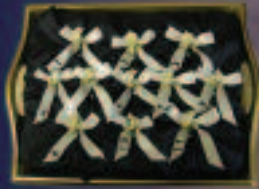
The rings awaiting a blessing lie on the altar.

All the eleven signed vow charts were slipped under the altar cloth to lie directly under the corporal on which the Holy Sacrifice of the Mass was offered.