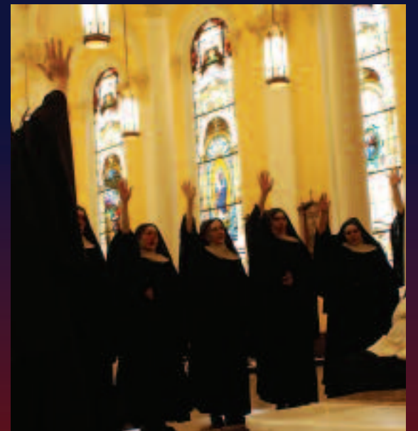
Showing the rings to all in the church, while chanting "My Lord Jesus Christ has espoused me with His ring and as His bride, adorned me with a crown."