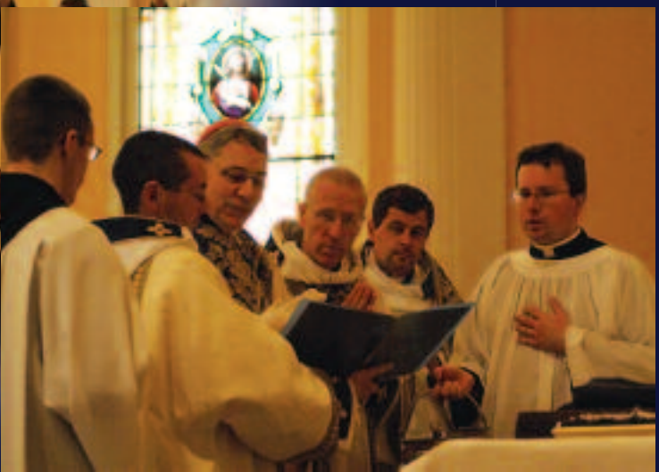
Blessing of rings and choir veils