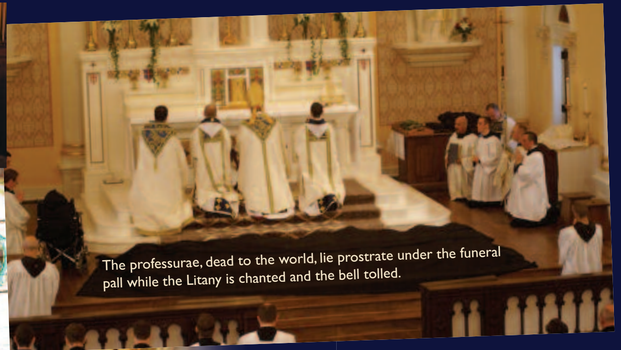
The professurae, dead to the world, lie prostrate under the funeral pall while the Litany is chanted and the bell tolled.