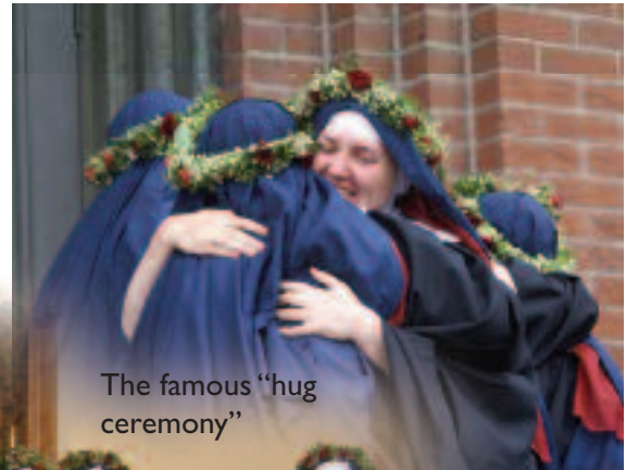
The famous "hug ceremony"