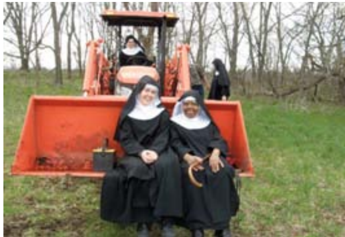
Taking every opportunity to get out of the city

ed apostolate for the support of priests, we remain within the cloister of our Priory for all else, excepting necessary appointments and shopping, until we are settled and have built up an auxiliary band of Oblates to take care of temporal necessities for us. It will always be considered the external expression of our charism to welcome clergy for private retreat and spiritual refurbishment, and to attend Ordination, Candidacy and Chrism Masses.