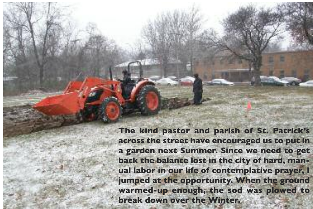
The kind pastor and parish of St. Patrick's across the street have encouraged us to put in a garden next Summer. Since we need to get back the balance lost in the city of hard, manual labor in our life of contemplative prayer, I jumped at the opportunity. When the ground warmed-up enough, the sod was plowed to break down over the Winter.

You, dear families, whom God ordained to form, foster and prepare each of us for this consecrated, monastic life; friends, who have encouraged and supported each of our nuns or our endeavors undertaken for His glory; benefactors, whom the Saviour has chosen to exercise His providential care over our fledgling community and our Priory; lastly, those of you who, knowing we "have Our Lord's ear", have entrusted to us your prayer intentions; all of you, each and every one of you, will be remembered in a special way during the Divine Office and three Masses of Christmas—midnight, dawn and in the day.