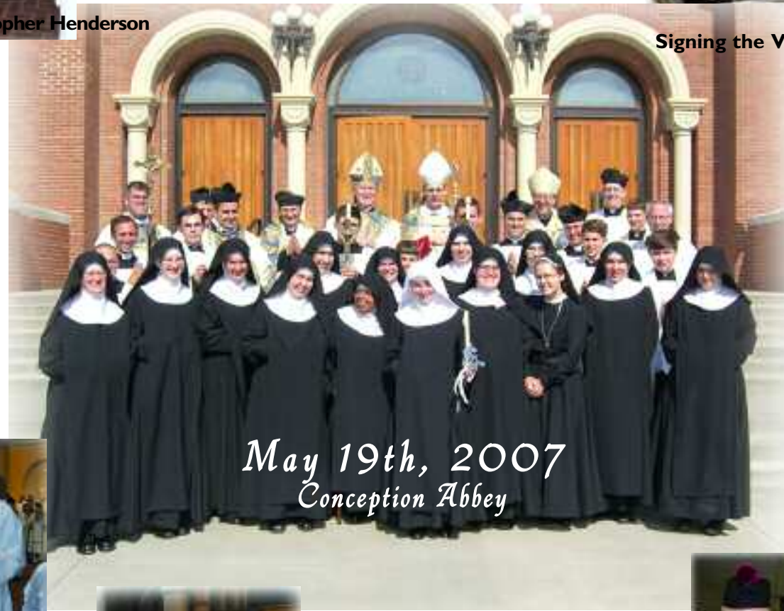
May 19th, 2007 Conception Abbey