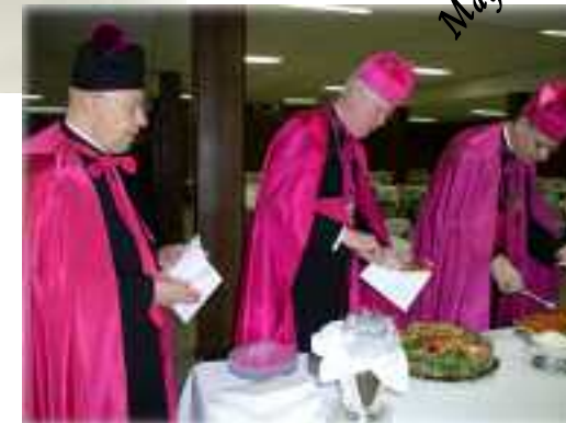
See more at www.benedictinesofmary.org