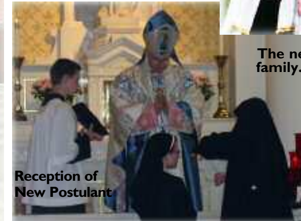
Reception of New Postulant