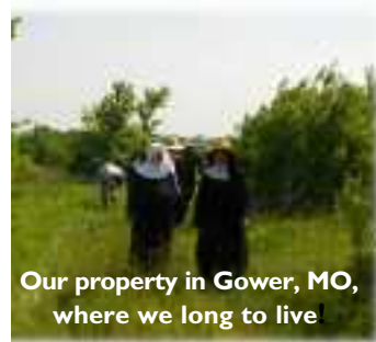
Our property in Gower, MO, where we long to live