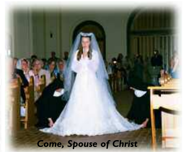
Come, Spouse of Christ