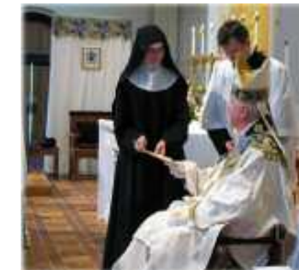
Showing the Signed Profession Chart to the Prelates