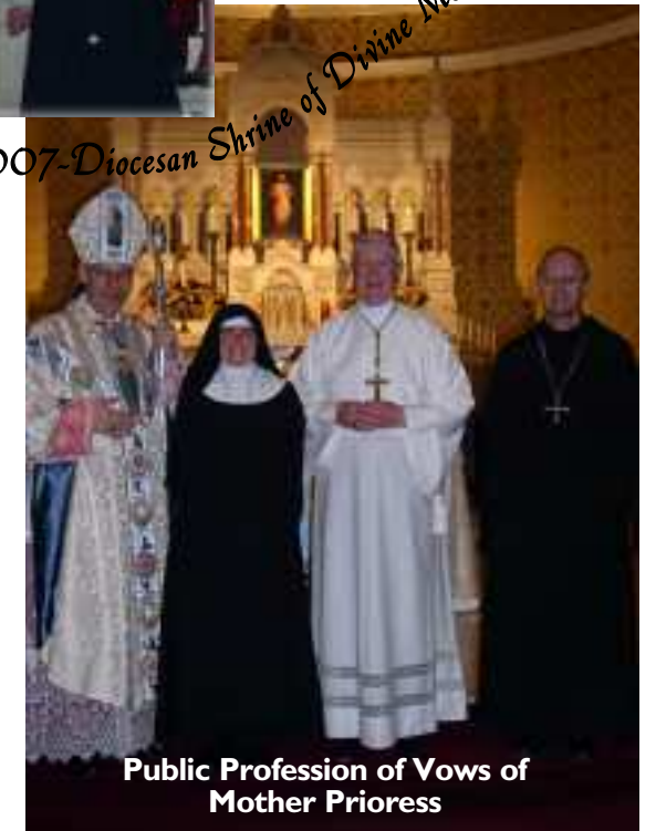
Public Profession of Vows of Mother Prioress

May 18th, 2007 - Diocesan Shrine of Divine Mercy