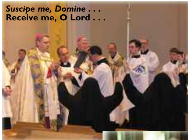
Suscipe me, Domine . . . Receive me, O Lord . . .