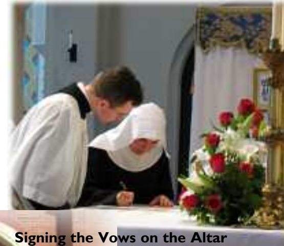
Signing the Vows on the Altar