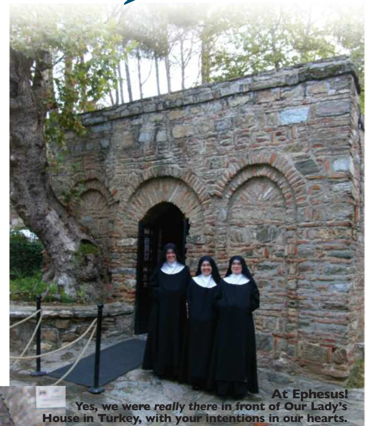
At Ephesus! Yes, we were really there in front of Our Lady's House in Turkey, with your intentions in our hearts.

This awesome confirmation of our community's charism to emulate the life of Our Blessed Mother, especially in her role in the early days of the Church as a presence and support to the first priests, the Apostles, was viably felt when we entered her humble abode.